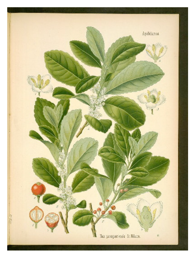
Fig. 6-5. Ilex paraguariensis var. paraguariensis- leaves, fruit and flowers (Missouri Botanical Garden)

Ilex paraguariensis A. St-Hil. var. paraguariensis is a dioecious evergreen tree that grows to a height of up to 18 m (Fig. 6-5). Its leaves are alternate, coriaceous and obovate with a serrate margin and obtuse apex. The inflorescences are in corymboid fascicles, the male ones in a dichasium with three to 11 flowers, the female ones with one or three flowers. The flowers are small, and simple, number four or five and have a whitish corolla. The fruit is in a nucule; there are four or five single seed pyrenes (propagules) (Giberti, 1994).