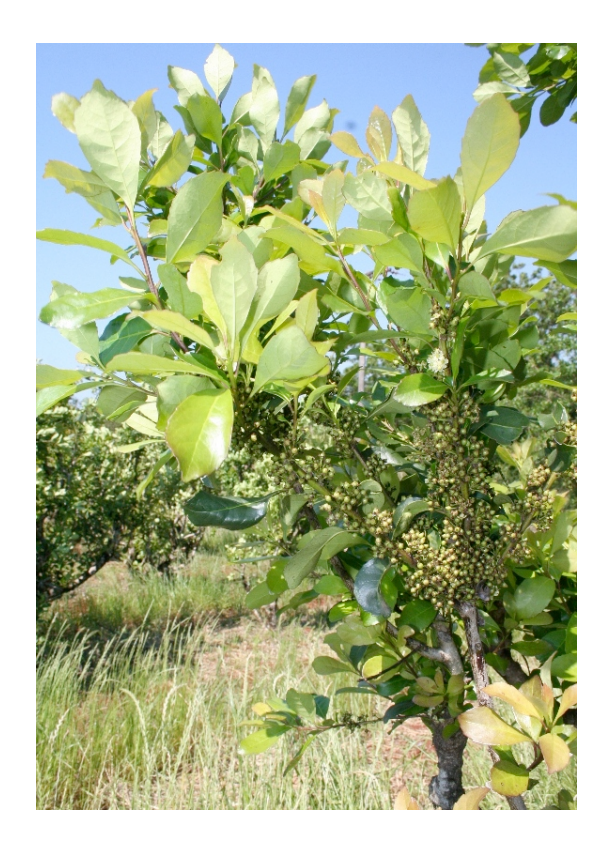
Fig 6.6 llex paraguariensis tree plantation (INYM- Argentina

native to Paraguay, Argentina and Brazil, the producer of a bitter-tasting maté and supposedly cultivated in Misiones by the Jesuits to produce their famous "caá miní" maté; I. dumosa var.dumosa is also used. Ilex theezans C. Martius ex Reisseck (cauna de folhas largas, ca'a na, congonha), is a good substitute for I. paraguariensis , found in Paraguay, Argentina and Brazil. Ilex brevicuspis Reisseck, known as cauna or voadeira, produces low quality mate.