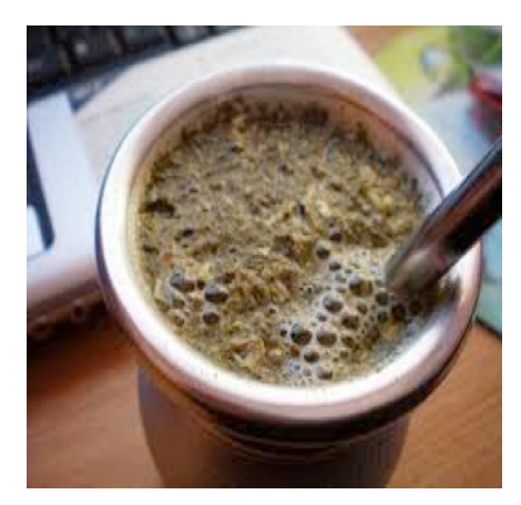
Fig. 6-3 Typical mate gourd and "bombilla" and commercial yerba mate.

The term "mate" in Spanish or "cuia" in Portuguese, derives from the Guaraní term "matí" for the gourd made from the dry and hollowed fruit of Lagenaria vulgaris Ser. (Cucurbitaceae) in which the beverage is prepared (Villanueva, 1995). These gourds vary in size throughout the region ranging from 7 to 12 cm in diameter and have an approximate volume of 50-100 ml. The hole at the top allows the "mate" to be filled with the dry roasted leaves (Fig. 6-3). Once this is done, water that is heated to approximately 90°C is added to the gourd and a straw like metal tube is inserted into the "tea". This tube or "bombilla" has a flattened open end that serves as a mouthpiece and finishes in a closed perforated bulb-like filter that is inserted into the mate. This bulb is approximately the size of a teaspoon and the perforations, which are the size of a pinhole, act as a filter avoiding the aspiration of solids – the mate leaves – when the infusion is sucked up through it (Bracesco et al., 2011). Once this "extract" is drunk, hot