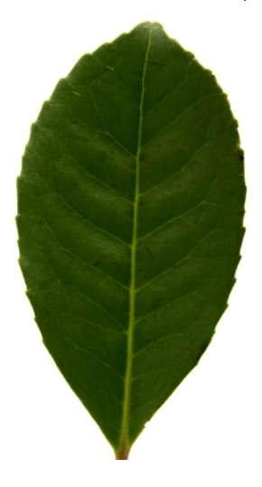
Fig. 6-1 Leaf of Ilex paraguariensis (Aquifoliaceae)

Yerba mate or mate is the roasted and dried leaf of Ilex paraguariensis A. St-Hil. var. paraguariensis (Aquifoliaceae), one of the 400 or more species of the llex genus.