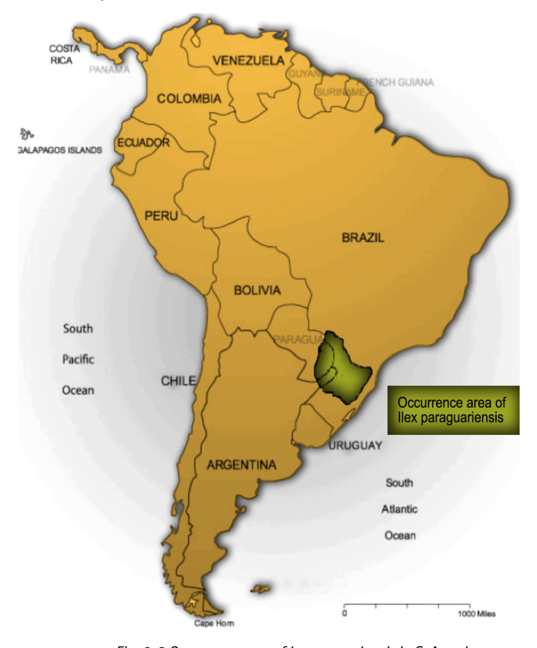
Fig. 6-2 Occurence area of I. paraguariensis in S. America

Its consumption as a decoction, but more popularly as a sort of in-situ lixiviate has been documented right back to the very first occupation of S. American territories by Spanish colonizers and Jesuits in the northeastern zone of what is now Argentina, Paraguay and south of Brazil and even if its use by Guaraníes was banned at times due to its stimulant properties, its consumption steadily grew, spreading to all the south of S. America with the exception of Chile.